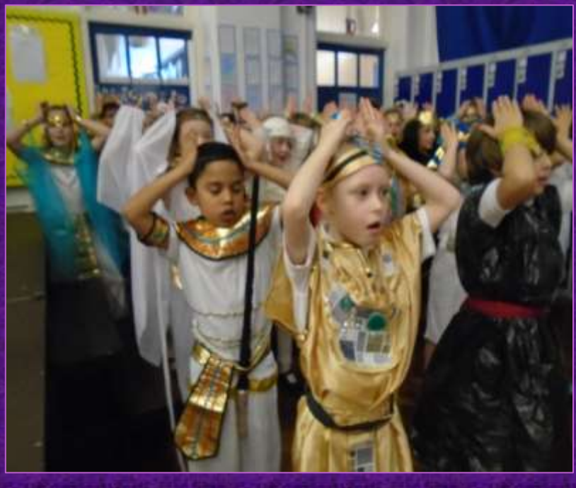
Tomb Raiders 'Event for families'